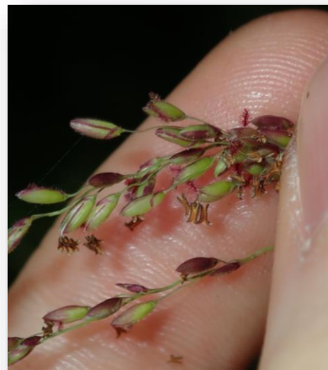
Credited to iNaturalist user thebeachcomber