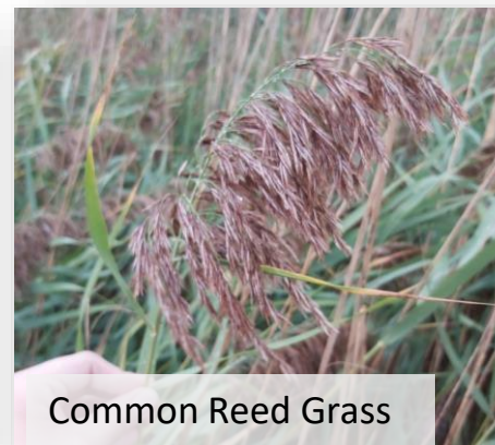
Common Reed Grass