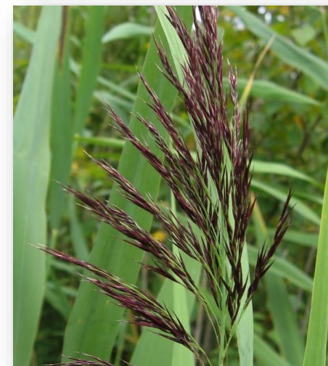
Credited to iNaturalist user joebartok