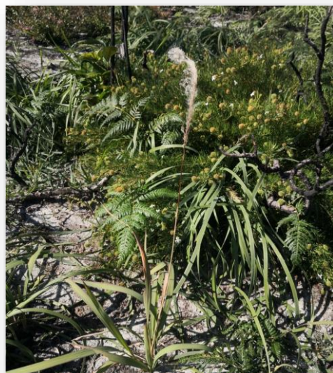
Credited to iNaturalist user nicklambert