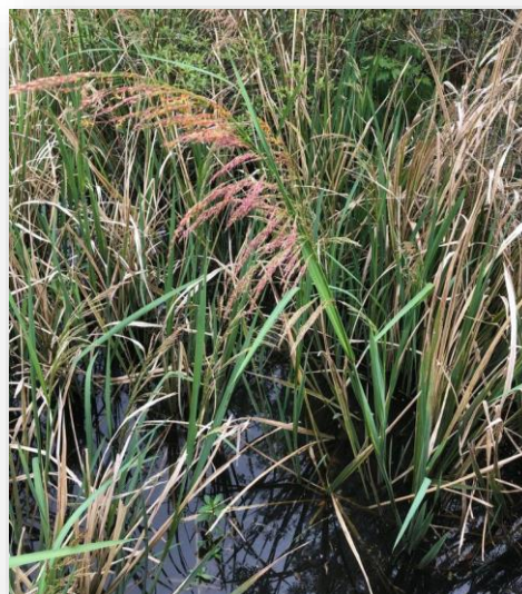
Credited to iNaturalist user janetwright