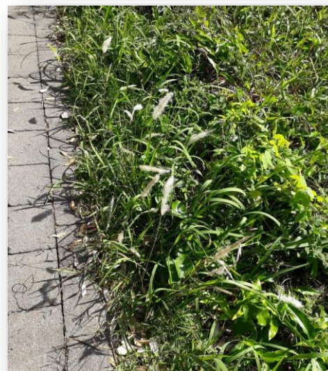
Credited to iNaturalist user nicklambert