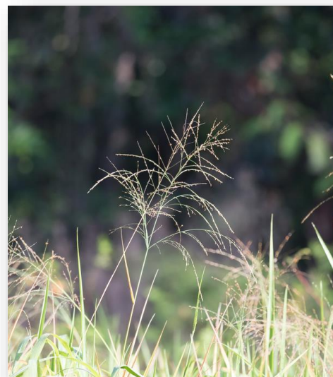
Credited to iNaturalist user knicolson