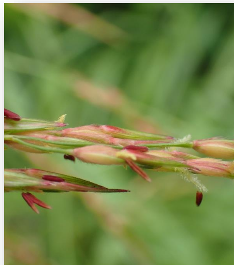
Credited to iNaturalist user yyykkykk