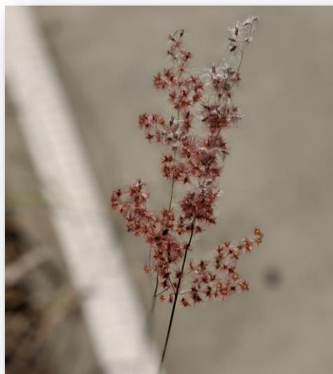
Credited to iNaturalist user beth544