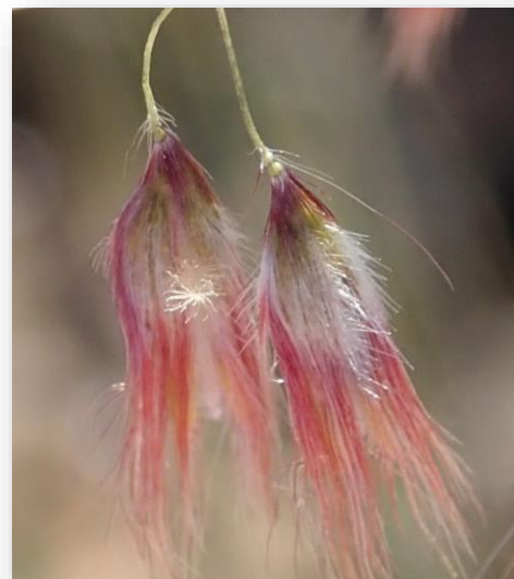
Credited to iNaturalist user nicky