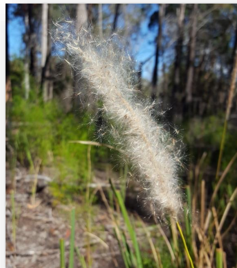
Credited to iNaturalist user annenautilus